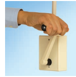
Steel Cable Winder (Up To 50Kg)*