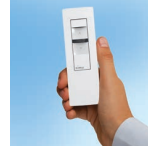
Remote Control With 240V Electric SIMU Hz Motor*