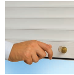
Spring Loaded With Key Lock