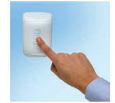
PowerSmart™ Control System With 12V Motor (Up To 50Kg)*