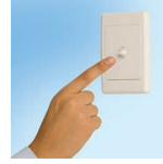
Wall Switch With 240V Electric Motor*