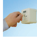
Key Switch With 240V Electric Motor