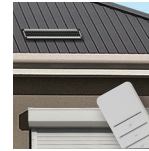
SolarSmart™ Plus Automation With 12V Motor (Up To 50Kg)*