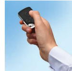
Key Ring Transmitter With 240V Electric Motor & SIMUDRIVE SD100 Hz Receiver & Control Unit*

* Control options must be installed in an indoor environment.