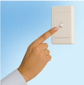
Wall Switch With 240V Specialised Electric SIMU Motor*

LockSafe™ Roller Shutters can be controlled via either a wall switch or a remote control transmitter.