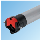
1. Specialised SIMU Motor