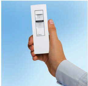
Remote Control With 240V Specialised Electric SIMU Motor*

* Control options must be installed in an indoor environment.