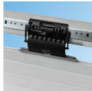
2. Integrated Rigid Fasteners