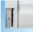
3. 2-Piece Bottom Bar With Lock-Bolt