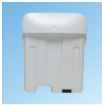
Removable, Rechargeable Battery