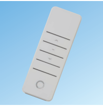
Optima 1 Channel Transmitter

PowerSmart™ incorporates a built-in radio receiver that is compatible with the Optima 1 Ch & 6 Ch Radio Transmitters. Both are powered by a 3 Volt Lithium button battery.