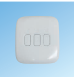
Bay Window (Multi Window) 3-Way Switch

* PowerSmart controllers must be installed in an indoor environment (for internal use only).