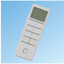
Optima 6 Channel Transmitter

The PowerSmart™ Single Window System includes a controller, removable battery & PowerSmart™ charger. The PowerSmart™ Bay Window System (multiple windows) includes an additional 3-way switch.