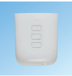
Controller With Built-In Radio Receiver

The PowerSmart™ Single Window System includes a controller, removable battery & PowerSmart™ charger. The PowerSmart™ Bay Window System (multiple windows) includes an additional 3-way switch.