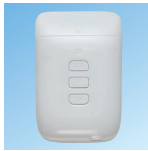
Assembled Controller & Battery